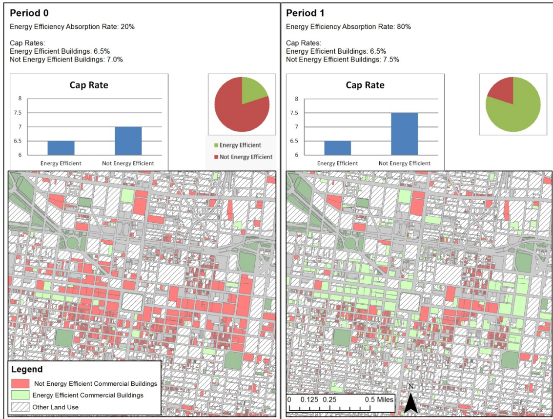
Figure 1: Market Penetration of AERs

To illustrate these CR effects, we use a hypothetical representation of the Philadelphia Office market. Our hypothetical example shows Philadelphia office pricing at two time periods, representing a low level of AER building penetration (Period 0, left) and a much higher level of AER penetration (Period 1, right).